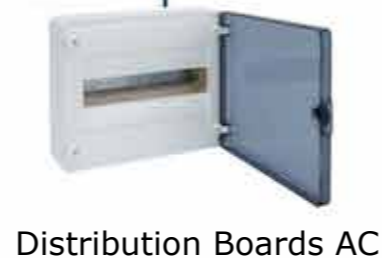
Distribution Boards AC